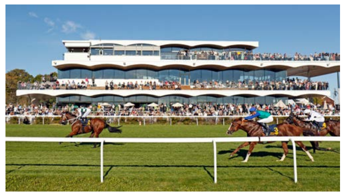
Aphelios ( Kodiac) strides to a comfortable victory in the Listed Bro Park Sprint Championship over 1200m on Sunday.