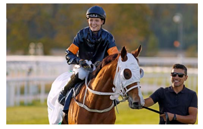
Little Arabella (Karakontie) landed the first black-type success of her career at Bro Park on Sunday in the Listed Lanwades Stud Stakes over 1600m.