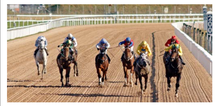
Twirling Ghost (Twirling Candy ; green and gold colours on the right hand-side) put in a bold front-running display to win Sunday's only dirt race at Bro Park, the Listed Tattersalls Nickes Minneslöpning over 1600m.

The Twirling Candy colt was bred by BD Gibbs Farm and Fleetwood Bloodstock and runs in the colours of Stall Poulard, having been picked up for $30,000 at the Keeneland September Yearling Sale. He finished third in June's Listed Challenge Stakes, but went two better in the Listed Zawawi Cup a month later, which came on a rescheduled Derby Day at Jägersro.